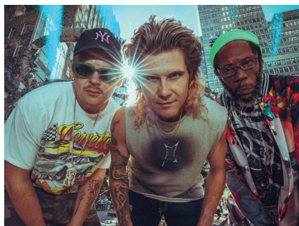
AMPLIFY MAINSTAGE SERIES

STANDARD $45 | SENIOR $42 | UNDER 30 $19