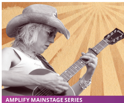
AMPLIFY MAINSTAGE SERIES