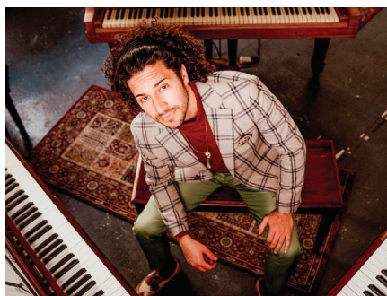
AMPLIFY MAINSTAGE SERIES

STANDARD $65 | SENIOR $62 | UNDER 30 $29