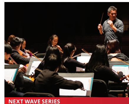
NEXT WAVE SERIES

STANDARD $27 | SENIOR $24 | UNDER 30 $15