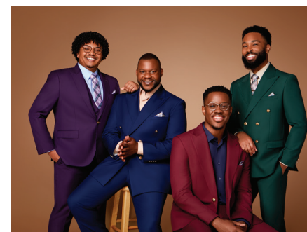
AMPLIFY MAINSTAGE SERIES

STANDARD $55 | SENIOR $52 | UNDER 30 $29