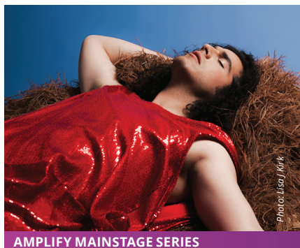
AMPLIFY MAINSTAGE SERIES