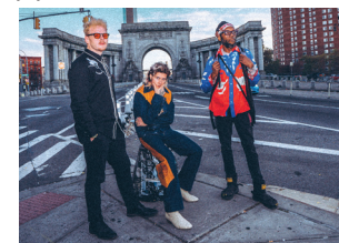
TOO MANY ZOOZ