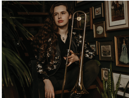
NEXT WAVE SERIES

STANDARD $45 | SENIOR $42 | UNDER 30 $29