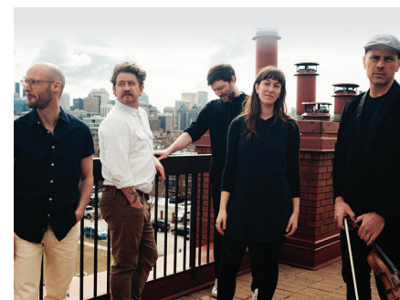
AMPLIFY MAINSTAGE SERIES

STANDARD $55 | SENIOR $52 | UNDER 30 $29