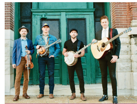
AMPLIFY MAINSTAGE SERIES

STANDARD $55 | SENIOR $52 | UNDER 30 $29