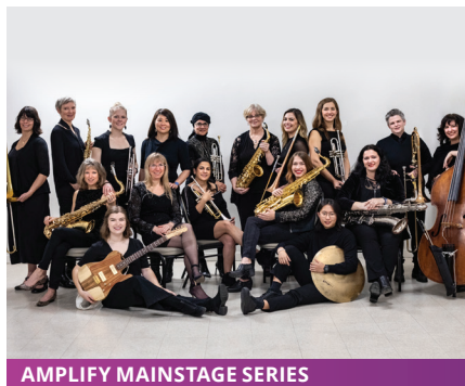
AMPLIFY MAINSTAGE SERIES

PREMIUM $60 | STANDARD $55 SENIOR $52 | UNDER 30 $29