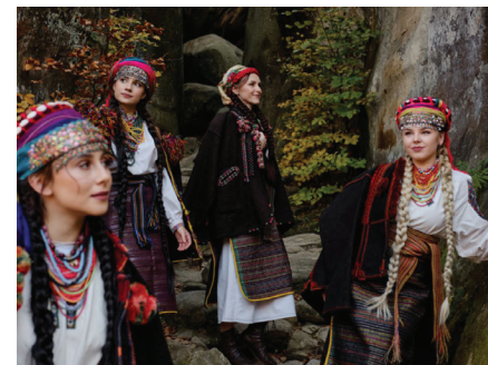
AMPLIFY MAINSTAGE SERIES

STANDARD $55 | SENIOR $52 | UNDER 30 $29