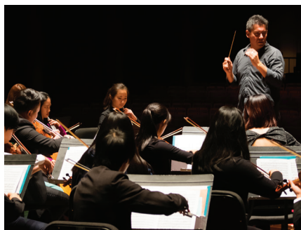
NEXT WAVE SERIES

STANDARD $27 | SENIOR $24 | UNDER 30 $15